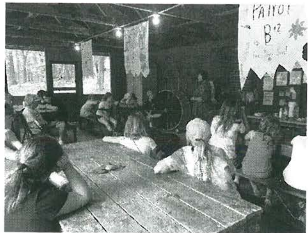
Learning about the layers of the atmosphere