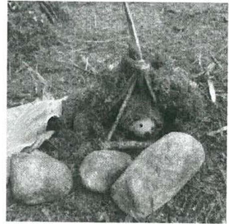
A shelter from the storm!

Campers got to learn about hurricanes, tornados, rain and snow. They made their own rain gauges, weather vanes, and even clouds! They worked together to build shelters for their woodland (stuffed) animals and then tested them against wind storms. Girls worked on their camp progression patches by learning about fire safety, first aid and knot tying.